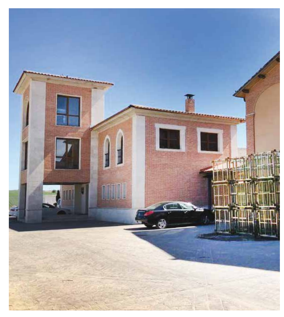
TRUS - One of the most important winery of Valladolid

In January 2021 the pre-insulated flexible piping system Microflex has been chosen to realize water, sanitary and heating systems of the new plant section of one of the most important winery of Valladolid. It is a winery called TRUS and it is located in one of the richest vineyards of Valladolid, where wines get the Ribera del Duero certificate of origin.