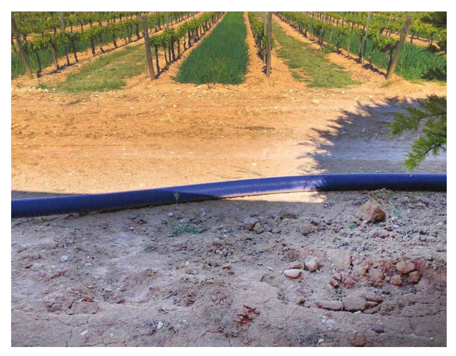
Microflex pre-insultaed flexible piping system